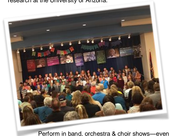
Perform in band, orchestra & choir shows—even current musicals!