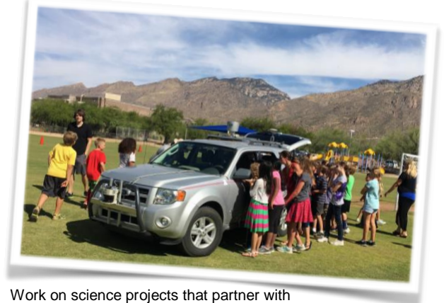
Work on science projects that partner with research at the University of Arizona.