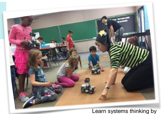
Learn systems thinking by programming robots.