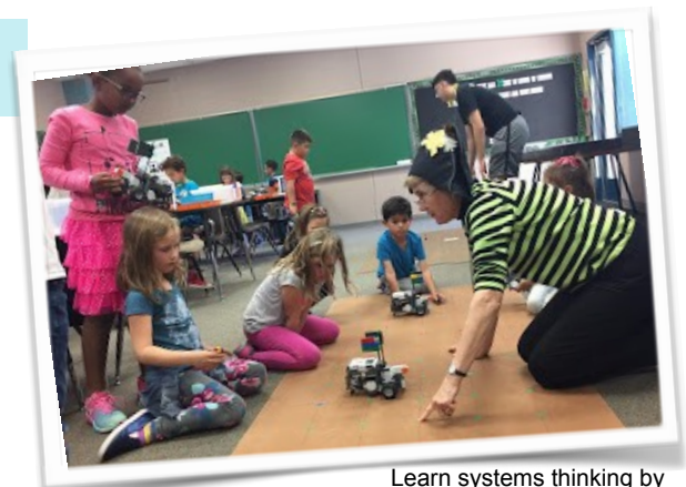
Learn systems thinking by programming robots.