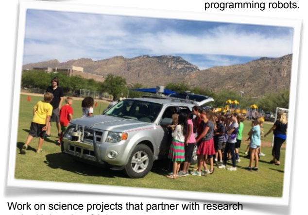
Work on science projects that partner with research at the University of Arizona.