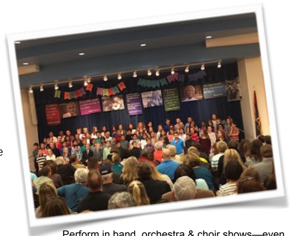
Perform in band, orchestra & choir shows—even current musicals!