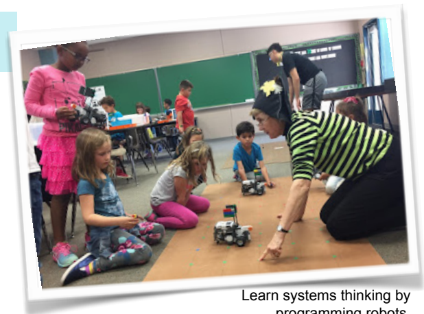
Learn systems thinking by programming robots.