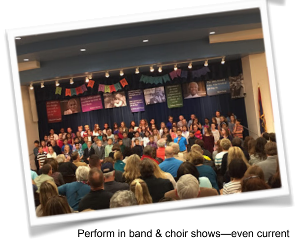
Perform in band & choir shows—even current musicals!