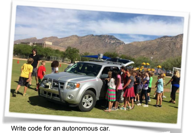
Write code for an autonomous car.